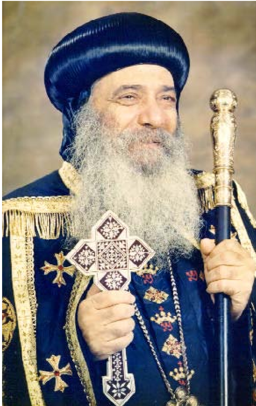
H.H. Pope Shenouda III, 117th Pope of Alexandria and the See of St. Mark