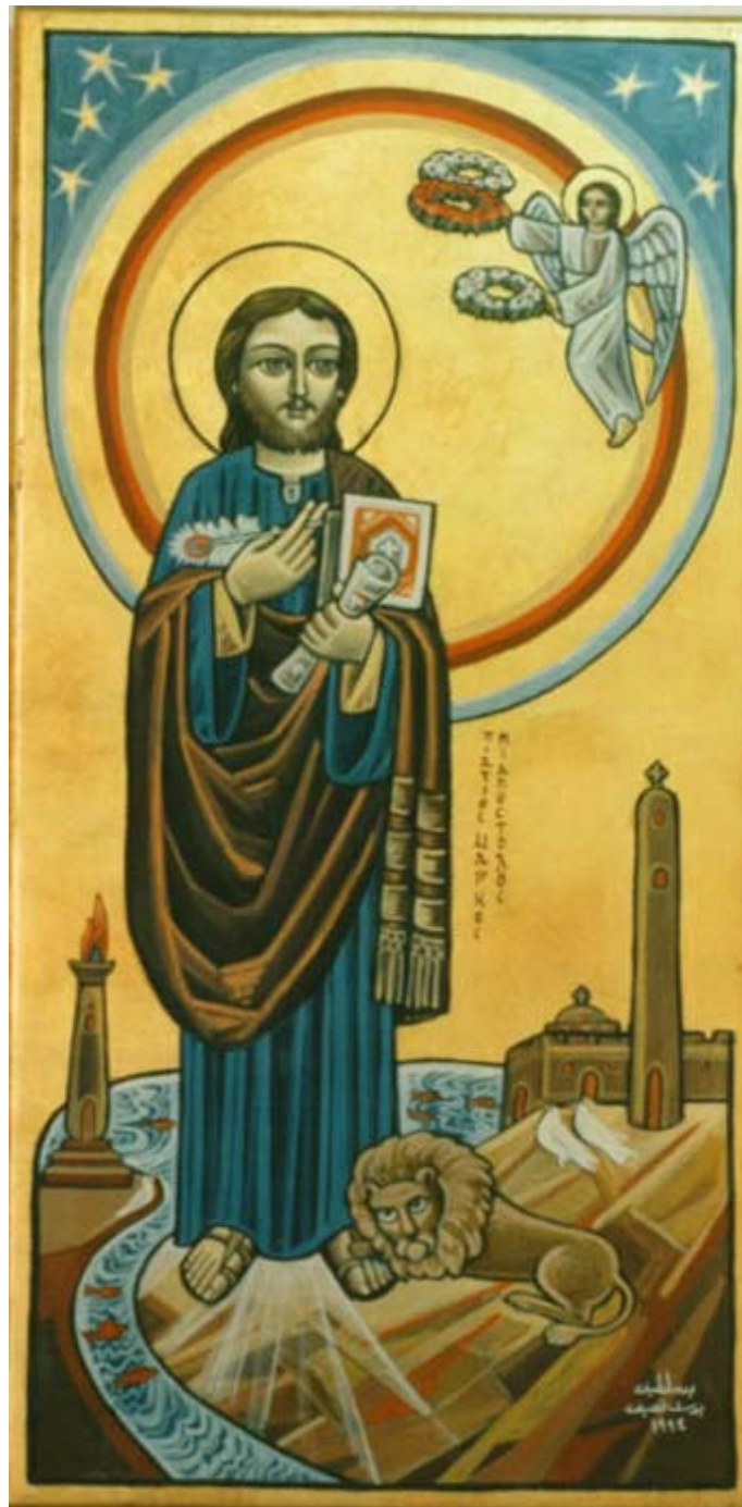
THE BEHOLDER OF GOD MARK THE EVANGELIST SAINT AND MARTYR