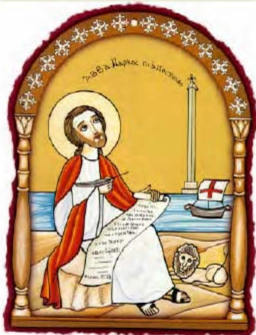
THE BEHOLDER OF GOD MARK THE EVANGELIST SAINT AND MARTYR