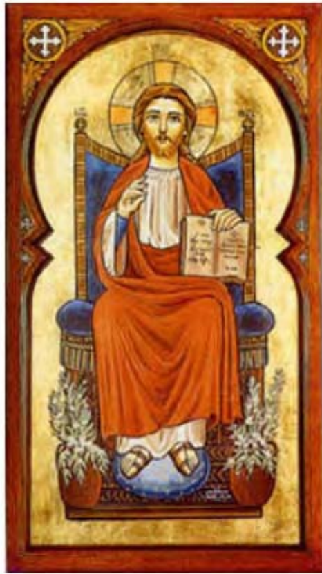
Our Lord and Saviour Jesus Christ, King of Kings and Lord of lords