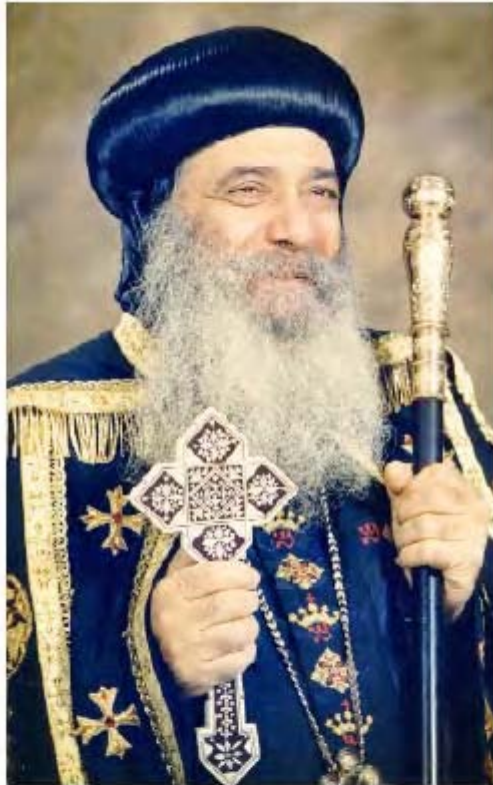
H.H. Pope Shenouda III, 117th Pope of Alexandria and the See of St. Mark